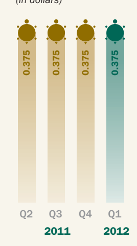
Closing Stock Price (in dollars)